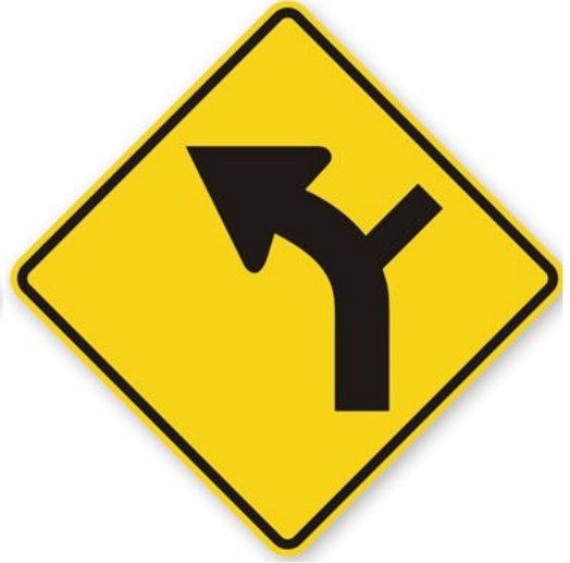
24" x 24"