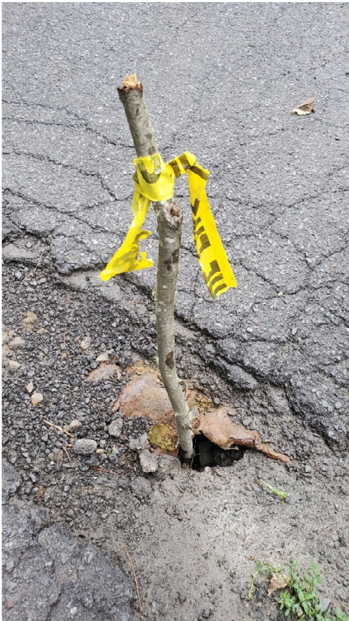
Rotted Culvert Pipe at Birch and Iroquois