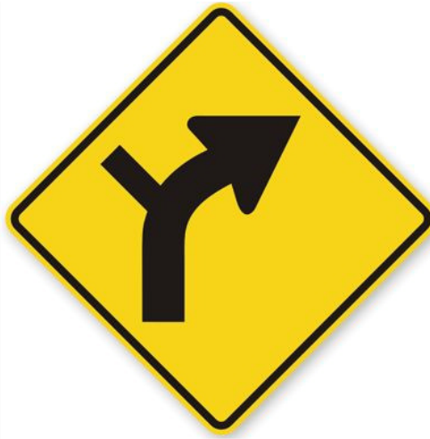
24" x 24"