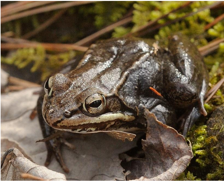
Figure 1 This is a wood frog near a pond during mid-March. Most of the frogs were in the water. Most wood frogs seen during breeding season are dark brown in color, so the "Robber's Mask" is not as evident.

One of the first things we hear in the spring is frogs. Spring peepers are widespread and are heard early in the spring, usually on the first few mild days of late March or early April. They are hard to spot however due to their small size and habit of calling mostly during darkness. Another frog that makes its appearance is the wood frog. Wood frogs have come almost a month early this year, appearing in early March instead of the usual early April. They favor vernal ponds in order to breed and can be heard calling with a quack like call as they seek a mate.